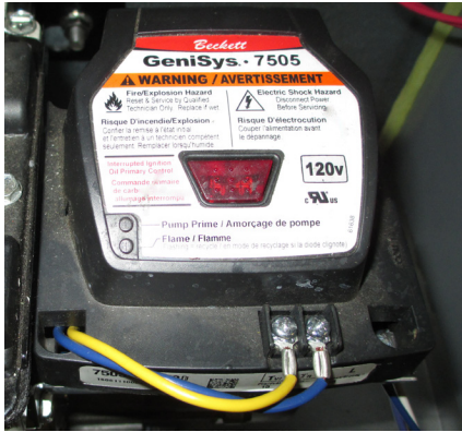
Figure 2 - Beckett Control