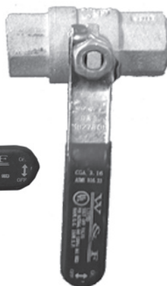
Control Valve "OFF"